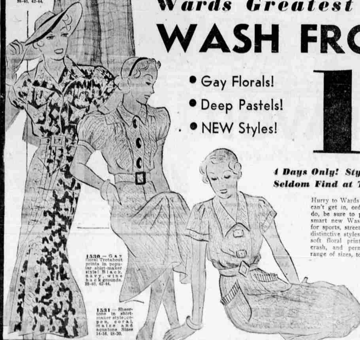
1530—Gay floral print in popular shirt-maker style. Black, navy, wine back grounds. 38-40, 42-44.

ORDER BY PHONE Just Call Wards and give your order, stating style and size and color desired.