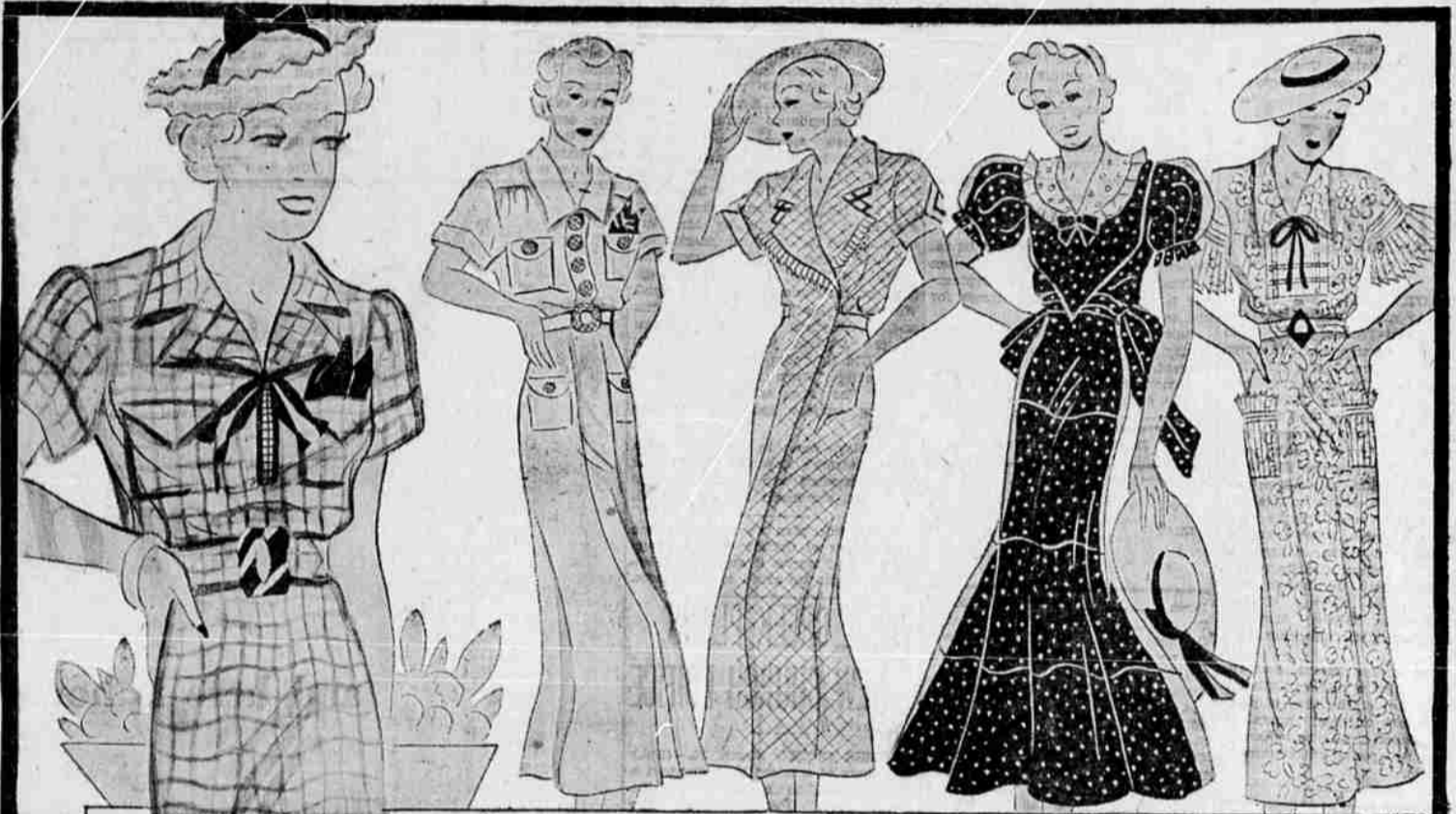
1401—Printed pique, with wide fastener, pleated skirt, in navy, white and aqua. Size 36-40, 42-44.