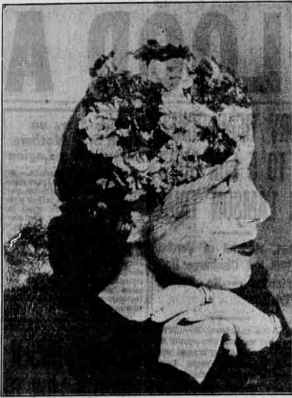
But, husbands note—this hat worn by Gladys Swarthroat, opera star, will not be one of the spring's "best sellers." It is trimmed with new 50-petaled nasturtiums developed at a cost of $15,000, which are a feature of the International Flower Show at New York.