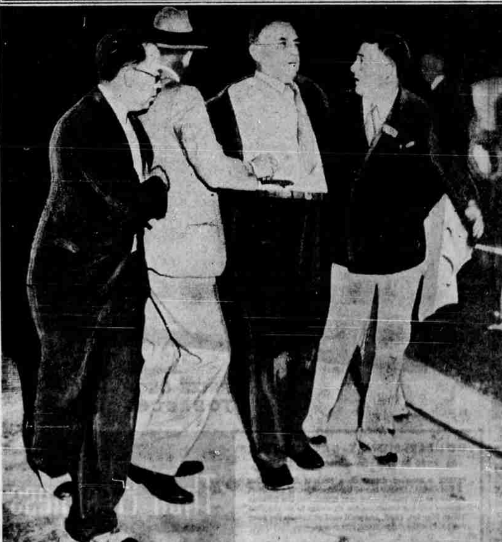
A bullet intended for President-elect Franklin D. Roosevelt, fired by Giuseppe Zangara while Mr. Roosevelt sat in a car at Bay Front Park, Miami, Florida, February 15, 1933, struck and fatally wounded Mayor Anton J. Cermak of Chicago. Mayor Cermak, who died March 6, is seen in this photo just after the shooting as he was being helped to a car. Zangara was electrocuted.

T HIS type of bunco artist has it all over the wire-tappers in other respects. A wire-tapper has one definite type of information to sell. The clairvoyant sells whatever his client wants, whether it is love advice, business advice, a message from a dead grandmother or a prediction of success as a movie star.