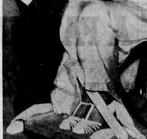
The bells are operated with several wires, also.

When I use a girl as the medium in a demonstration, she is actually bound and tied. But the cabinet that is put over her has a series of black piano wires through it, which are very strong and very taut. When I place a tambourine inside the cabinet, I do it in such a way that it balances on the wires, then with the proper pressure it will bounce up and down, finally springing off.