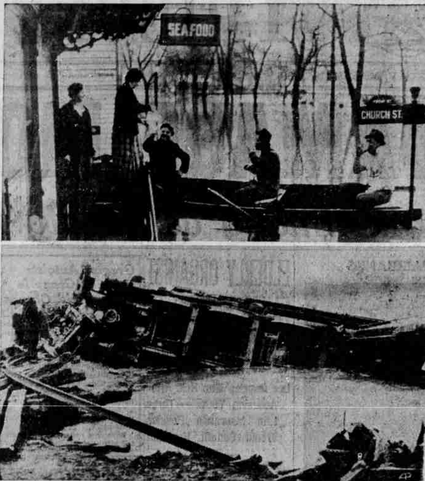
Terrific floods bringing both death and property destruction to several eastern states followed the breakup of massive ice jams in rivers and streams. Here are pictured contrasting results of light comedy and tragedy. Above, this "oyster bar" continued to do business at Easton, Pa., although the streets were under several feet of water. The boys got their beer and "sea food" from a boat, but it was just as good. Below, the engineer of this milk train was injured in Sussex county, N. J., when the locomotive struck a washout and left the tracks.