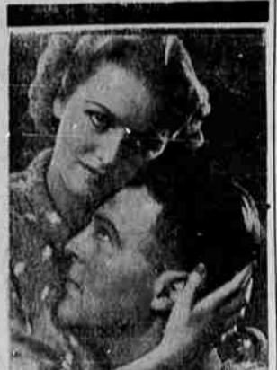
Today and Friday!

Following "Anything Goes" will come the second co-starring vehicle of Jeanette MacDonald and Nelson Eddy, whose teamwork in "Naughty Marietta" last year brought forth praise from audiences throughout the country and resulted in their being again cast together for "Rose Marie," pictureization of the famous musical romance of the Canadian Northwest.