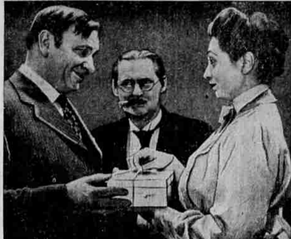
An outstanding drama of American life will be brought to the Craterian theater with the showing of "Ah, Wilderness," featuring Wallace Berry, Lionel Barrymore and Aline MacMahon in the leading roles.