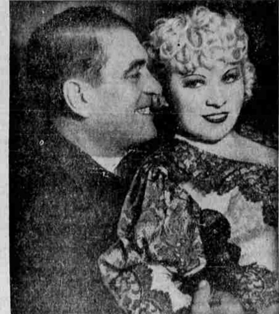
Victor McLaglen, winner of the Academy Award for 1915 with his work in "The Informer," is cast as Mae West's chief menace in "Klondike Annie," soon to be shown at the Craterian theater.

With advance reports bringing glowing notices of this new MacDonald-Eddy musical, "Rose Marie" is expected to set new box office records in Medford, as it has been doing elsewhere.