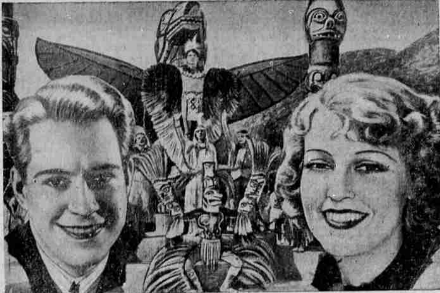
Reuniting the popular team of Jeanette MacDonald and Nelson Eddy, "Rose Marie," the screen's version of the famous musical romance set against the tall pines, the glimmering lakes and the picturesque background of the Canadian Northwest, opens its local run at the Craterian theater Sunday.