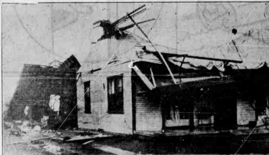
This house at Long Beach lost its roof and was otherwise damaged by gales which swept the area around Los Angeles in a heavy rainstorm. The nearby Long Beach oil field also suffered damage.