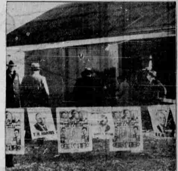
The Huey Long camp in Louisiana claimed "landslide" victories over anti-Long forces in a bitterly fought primary election in which the continuation of the assassinated senator's policies was the major issue. This picture shows a typical voting precinct near New Orleans flanked by signs urging voters to "carry on the work of Long and O. K. Allen."