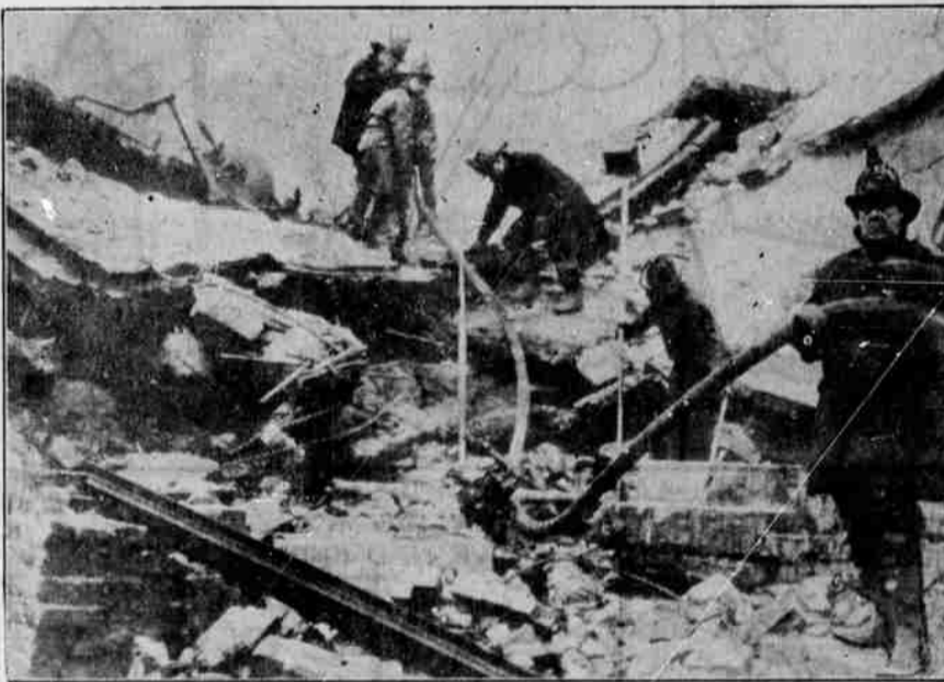
At least two workmen were killed when a hydrogen gas plant in Chicago's stockyards district was tumbled flat in an instant by a gigantic explosion. Firemen are shown running a hose line across the wreckage to quell the flames which followed the blast.