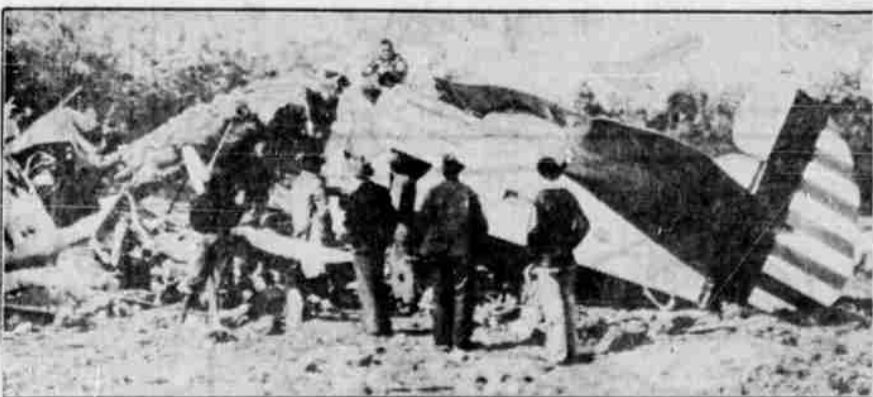
Four army aviators bailed out safely by parachute from 2,500 feet when a faltering motor caused this giant bomber to crash near Atlanta while on the way with 10 other bombing planes and 13 pursuit ships to the Panama canal zone. The heap of wreckage of the plane is shown above.