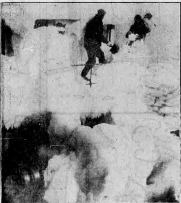
Brrr! Here is the bridge of the trawler Illinois as that fishing boat docked at Boston after a voyage to the Grand Banks off Newfoundland. The fishermen are attempting to clear ice from the windows of the bridge.