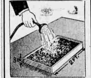
1. The Seed Bed

The best way for the spring gardener to get the jump on the weather is to do his first work in the house. A seed bed is the thing. Tender plants can be started while it's still too cold for them to live outside. Get a wooden box three inches deep, a foot wide and a foot and a half long. Fill it with fine, clean soil. Mark lines in the soil about half an inch deep and two inches apart. Seeds of tomatoes, eggplant, peppers, okra and the like should be placed about a quarter-inch apart, covered with fine soil. Sprinkle, put the box away in a warm place. When the plants peep out put the box in the sunlight. If it's by a window, turn the box halfway around each day to keep the plants growing properly.