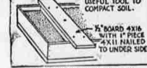
USEFUL TOOL TO COMPACT SOIL.