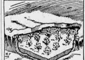
SECTION OF COLD FRAME SHOWING PLANTS GROWING DURING WINTER MONTHS.

Seeds of all except the more tender plants may be sown in cold frames