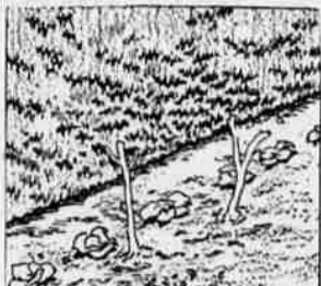
Honeycombed Condition of Soil as Frost Leaves

Plant food may be applied to lawns and established borders as soon as spring thawing begins. As the deep frost leaves the soil assumes a condition which has been described as "honeycombed." The surface is pitted and plant food applied at this stage will immediately dissolve and