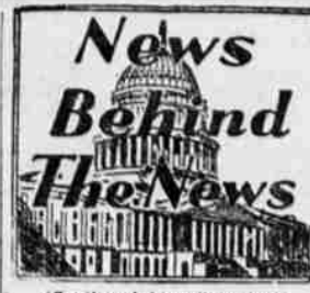
(Continued from Page One.)