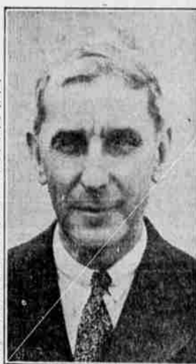
Thomas D. Campbell

When Thomas D. Campbell, America's largest raiser of wheat and internationally known farm expert talked to a group of Firestone men in Los Angeles recently, he confirmed the views of Mr. H. S. Firestone regarding the farm as an outlet for tires, according to (Name of Manager) of Firestone Auto Supply & Service Stores.