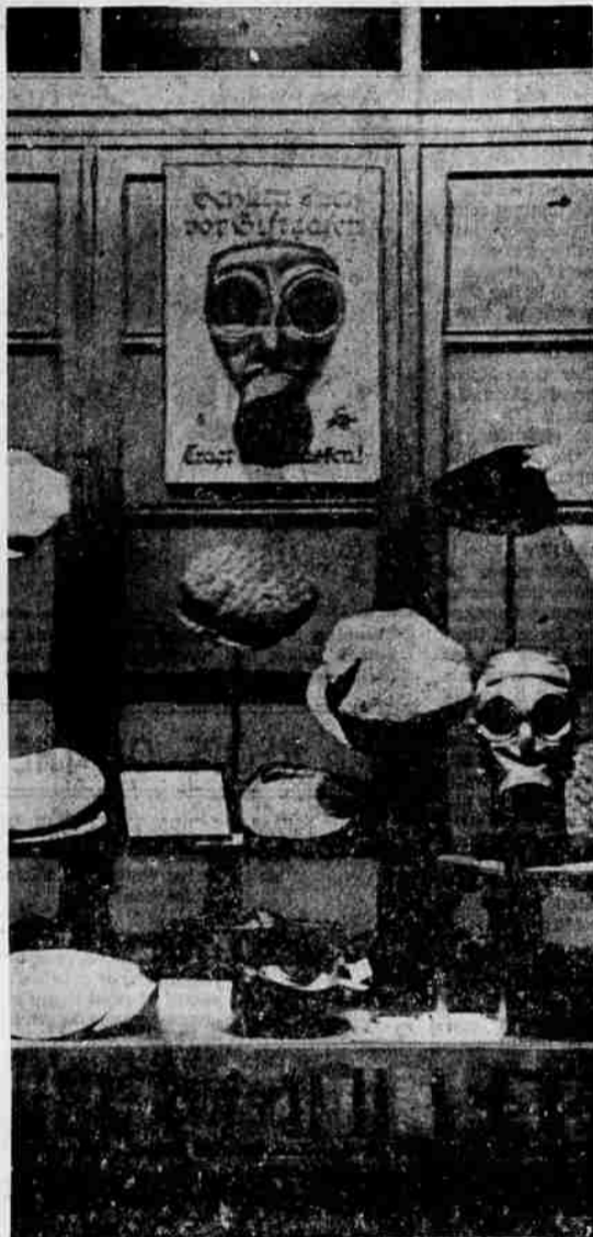
GAS MASKS are displayed in hat and clothing stores throughout Germany. This is a Leipzig window. The large placard in the window reads: "Protect yourself from poisonous gases. Carry gas masks."