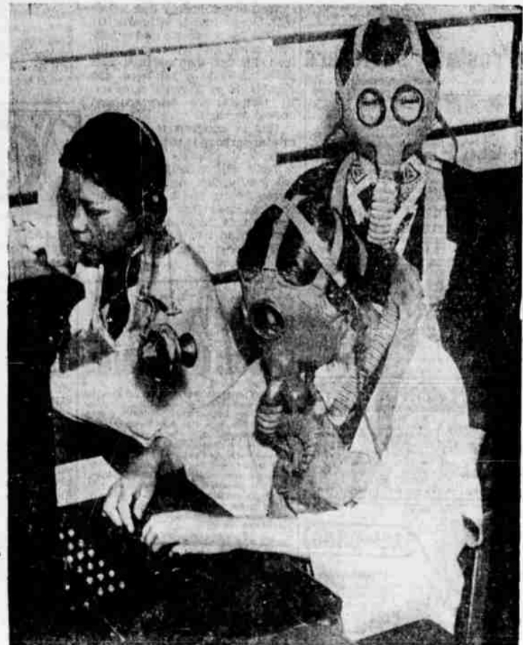
JAPAN PREPARES TO KEEP HER WIRES OPEN. Japanese switchboard operators in Tokyo department store are equipped with gas masks in event of aerial attack.