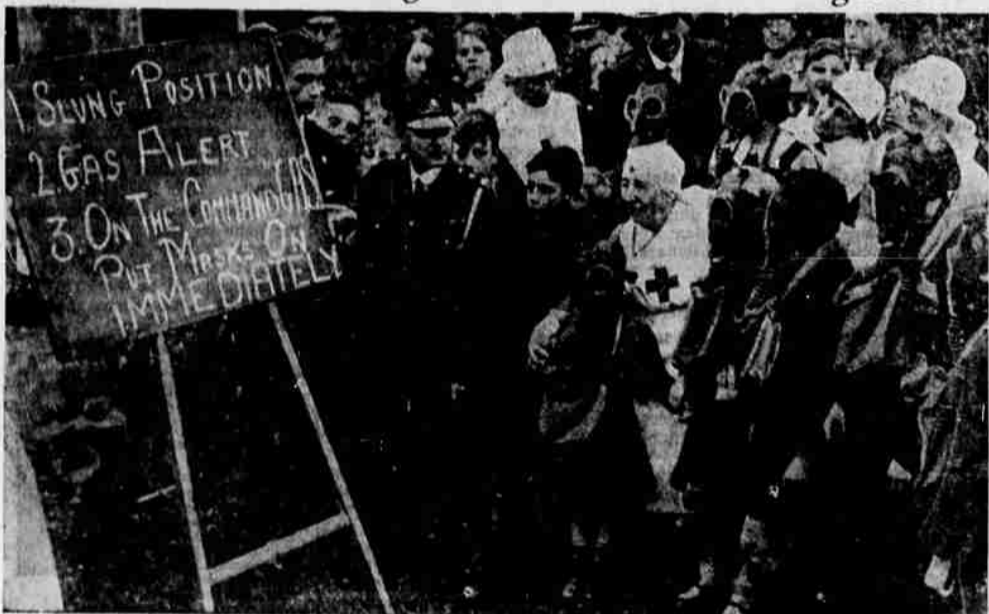
GAS-MASK DEMONSTRATIONS ARE HELD REGULARLY IN BRITAIN'S SCHOOLS.