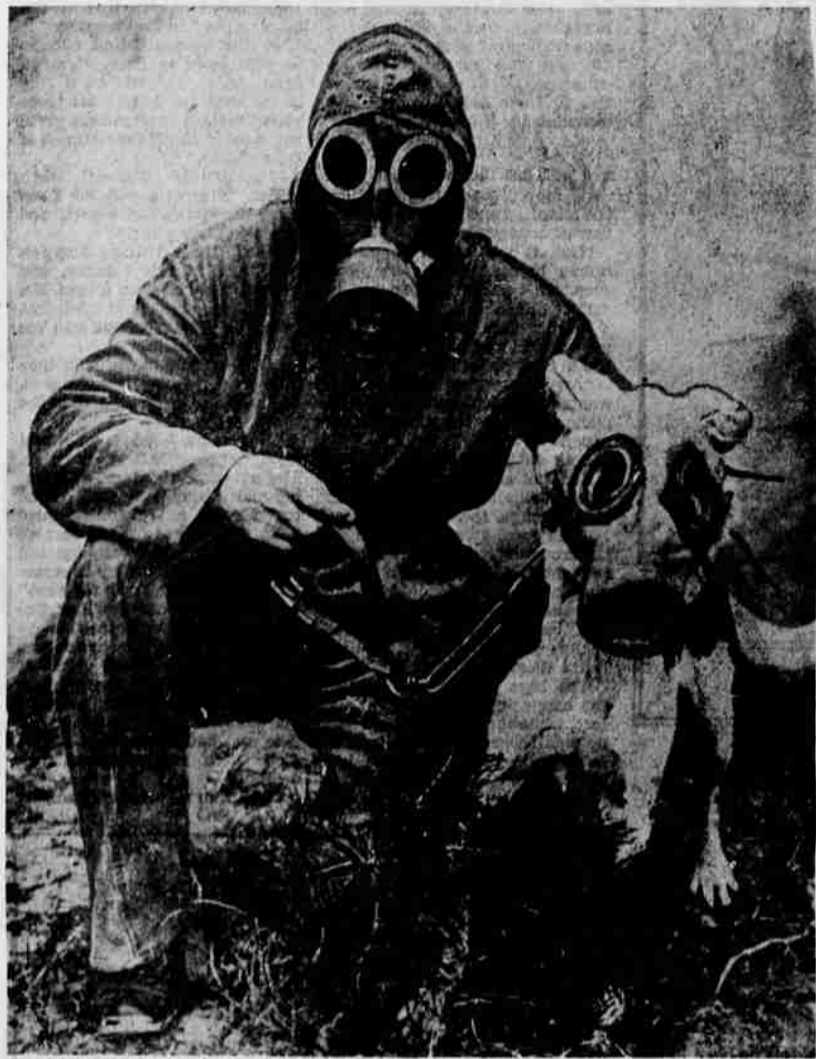
GERMANY'S CAMPAIGN AGAINST POSSIBLE POISON GAS ATTACK is the most gigantic of any nation. Horses and dogs are being accustomed to wearing gas masks.

There is also reported "Z" rays, to provide an "invisible wall" against France, and machine guns, weighing only eighteen pounds, and firing 600 rounds a minute. Copyright, 1936