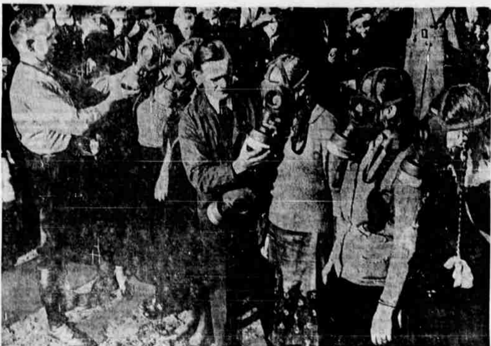
GERMANY ALSO TEACHES HER SCHOOL CHILDREN HOW TO WEAR GAS MASKS.