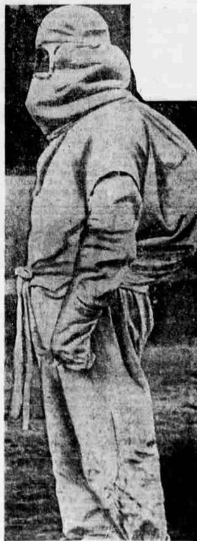
PROTECTION AGAINST GAS, FIRE AND ACID. The manufacturers of this outfit claim it will protect the wearer not only from gas, but fire and death-dealing acids. An oxygen tank is carried underneath on the back.