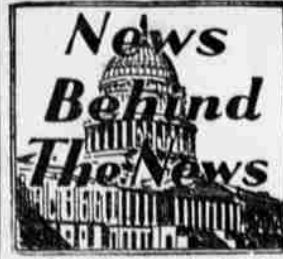
(Continued From Page One.)

So when you are worrying about the coming battle keep this thought in mind—we, the people, have fought and bled and died for something called liberty; it is most deeply rooted and it won't be easily uprooted, New Deal or not, Supreme court or not.—Emporia Gazette.