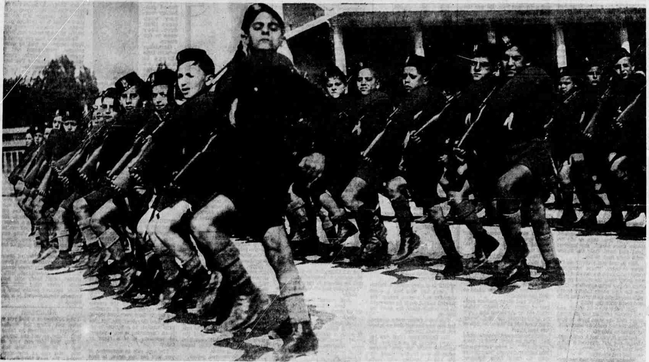
"CRADLE TROOPS, FORWARD MARCH!" THESE 14-YEAR-OLD ITALIAN BOYS ARE FULLY prepared for military service.

Since the arms men helped elect Hitler to power in Germany, thereby starting a world-wide race to re-arm, nations have been increasing their man power. COPYRIGHT, 1936