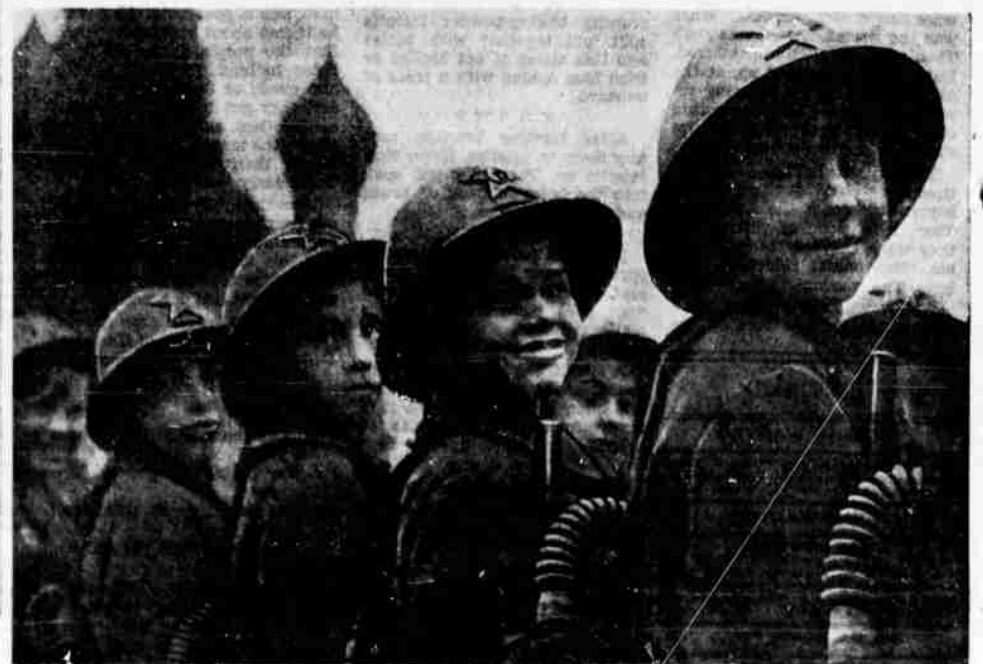
FIFTEEN-YEAR-OLD RUSSIAN GIRLS TAKE MILITARY TRAINING.