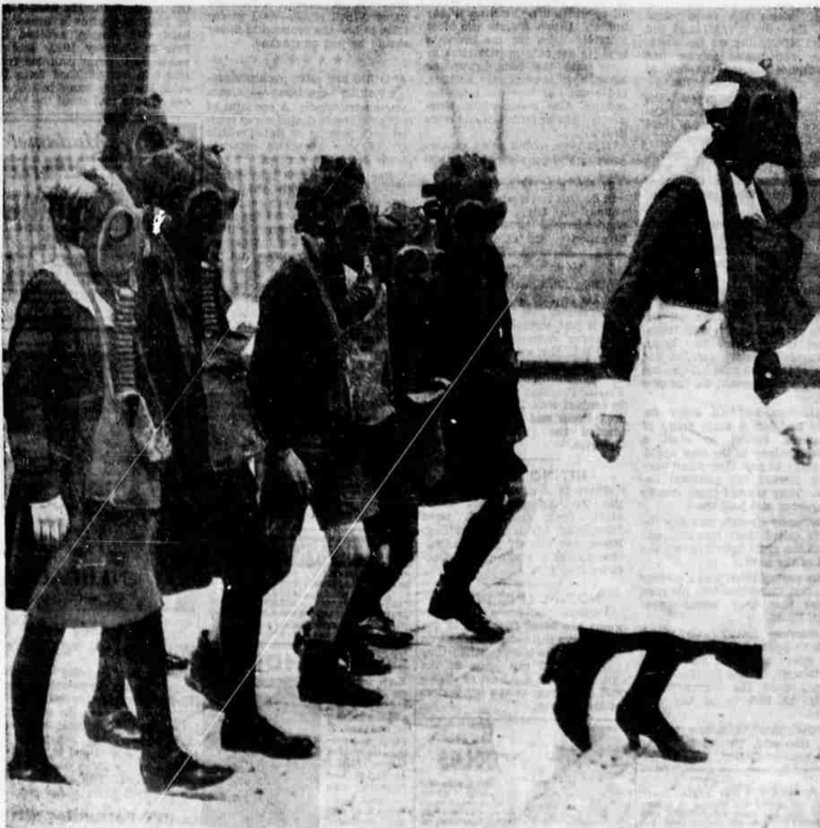
THOUSANDS OF ENGLISH CHILDREN, BOYS AND GIRLS, ARE RECEIVING MILITARY TRAINING. Britain heeds the warning of the British Army and Navy Gazette: "In the next war, the whole of the mankind, most of the womanhood, and part of the childhood will be involved."

Italian boys must enter military "kindergarten" at 4, and for seventeen years thereafter will study in a military environment. They will wear uniforms until they have completed their training. Not only do they learn the art of war—they are also taught patriotism . . . and fear