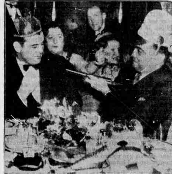
It was the right fist of James J. Braddock (left), holder of the world's heavyweight boxing title, against the toy gun of J. Edgar Hoover, head G-man, when they got together in celebration of the dawn of 1936 at New York.