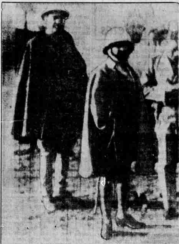
Haile Selassie (foreground), emperor of Ethiopia, is shown during his secret airplane tour of the southern battlefront when he inspected defenses thrown up against the invading Italian army. This picture was rushed to London and sent by radio to New York.