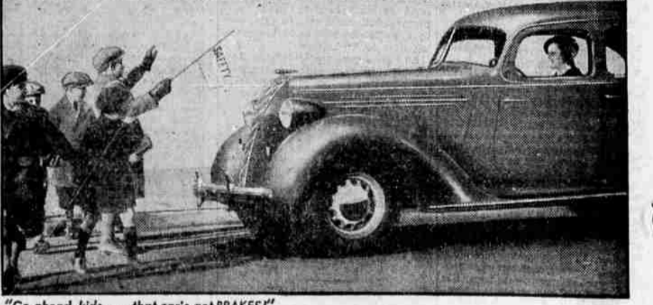
"Go ahead, kids . . . that car's got BRAKES!"