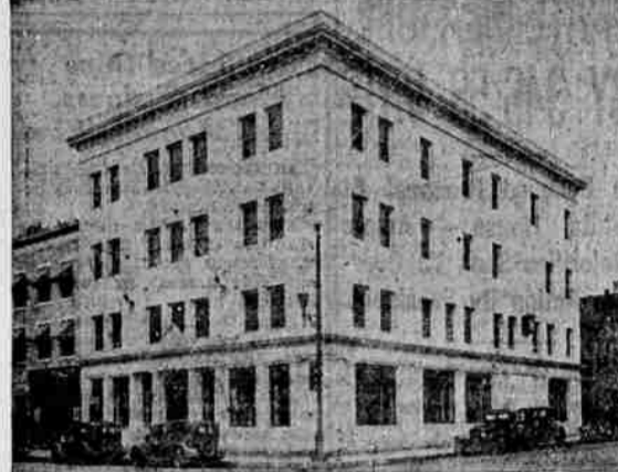
Above is shown "before and after" views of a Massachusetts bank which underwent an exterior modernization recently. Several improvements were made in the plan and general appearance of the structure. The entire exterior was faced with cut limestone, and the former outmoded appearance of the building is now supplanted by an atmosphere of modern dignity. Such modernization projects may be carried out with funds obtained under the Modernization Credit Plan of the Federal Housing Administration. Full information may be obtained at any local office or by writing the Federal Housing Administration, Washington, D. C.