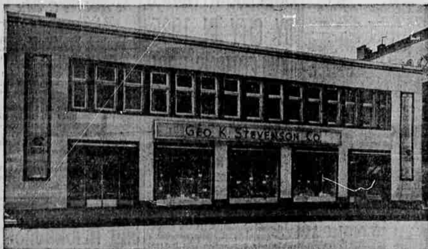
Above is shown "before and after" views of a Pittsburgh, Pa., building that was modernized at a cost of $9,782. In this case a deserted and virtually worthless property was rejuvenated into a modern, sales-compelling grocery. Similar modernization jobs may be done in any section of the country through revised regulations governing the Federal Housing Administration's modernization credit plan. Under the new arrangement a borrower may apply at private lending institutions for credit in amounts up to $50,000 to repair commercial or commercial-residential properties. Modernization credit will also be allowed for machinery and equipment of certain types. Formerly, modernization credit was only available in amounts up to $2,000.