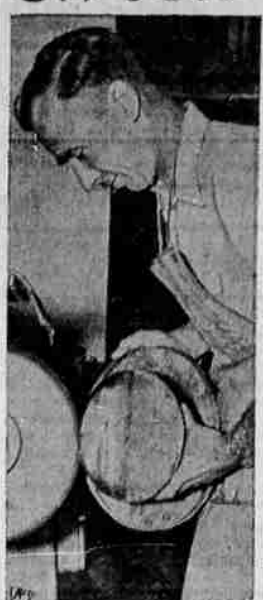
Old Clothes Maker

Fred Waring's task in the Hollywood movie studios is to make new clothes old, and old clothes older. To give the movie clothes their threadbare appearance he dumps the garments into washing machines and washes them for days at a time. He roughens shoes with files and sandpaper. Hats are held against a buffer to create worn spots. When wrinkles are ordered, the clothes are rolled into bundles and put into a press overnight. Dirty clothes—such as pirates and miners wear—are in reality clean clothes spotted with paint, sprinkled with fuller's earth and rubbed with lamp black.