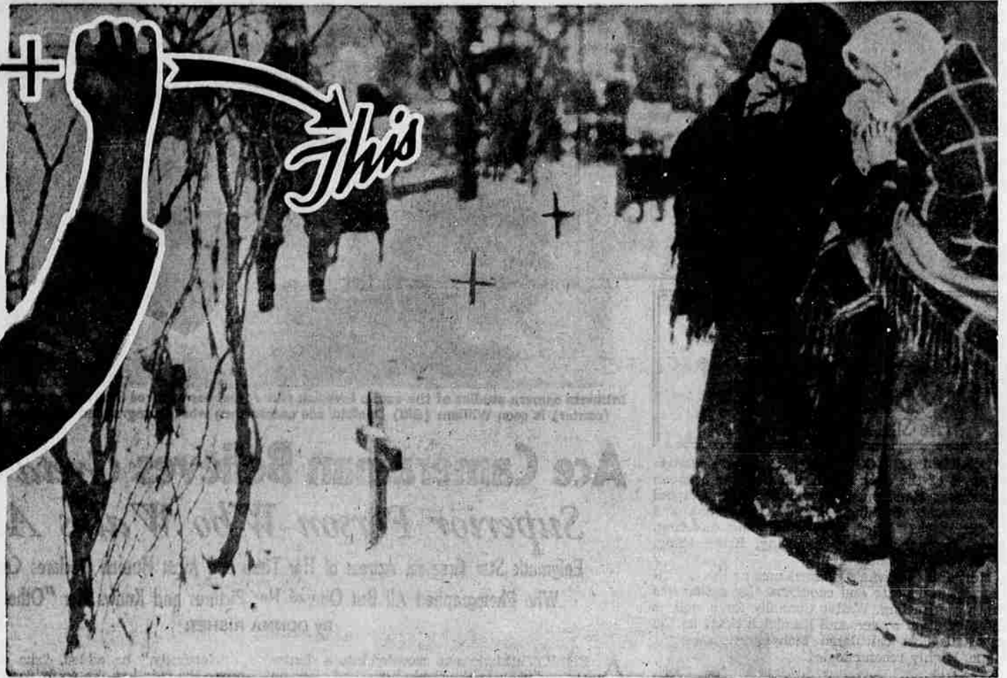
THEY MOURN A DEAD SOLDIER—HE WAS A SON TO ONE, HUSBAND TO THE OTHER.