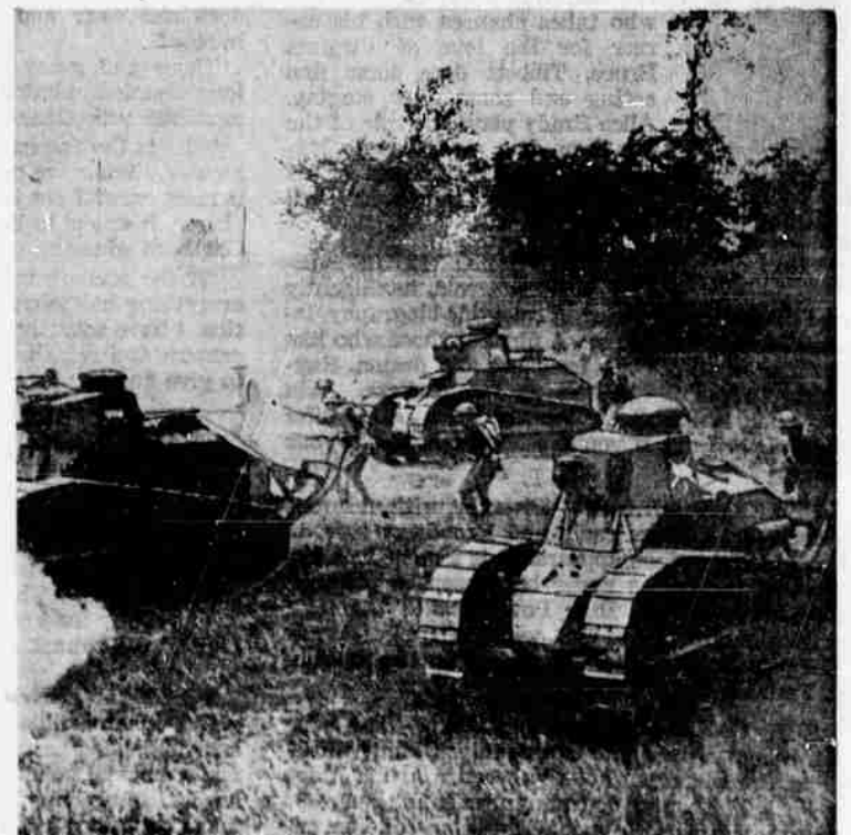
THE TANK, A COSTLY ARMORED MACHINE OF DESTRUCTION.