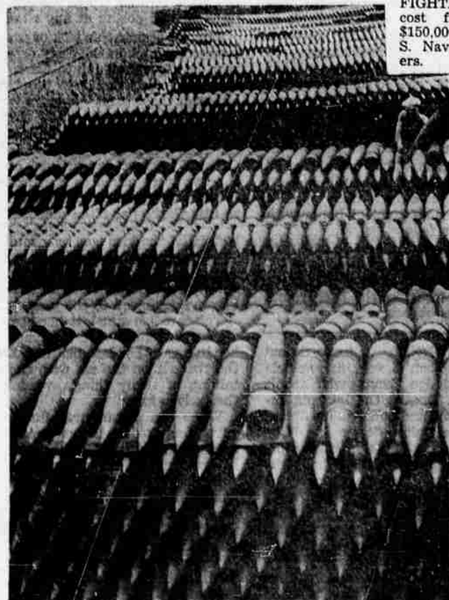
SIX MILLION DOLLARS' WORTH OF SIX-INCH SHELLS.