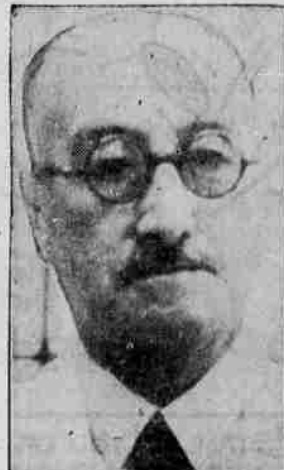
When Col. Carlos Mendieta resigned Cuba's presidency, Dr. Jose Barnet (above), 71-year-old secretary of state, automatically succeeded to the office pending the selection of a successor to Mendieta.