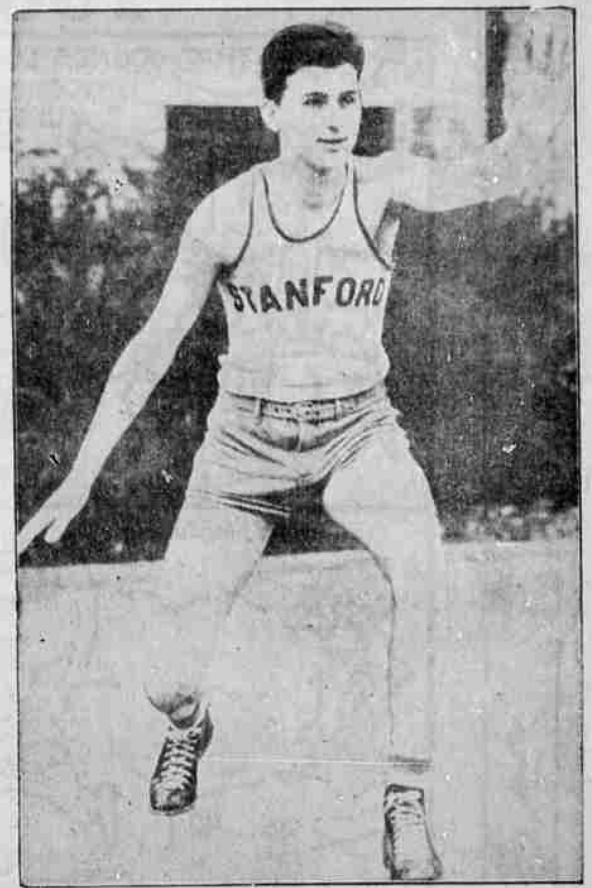
Angelo "Hank" Luisetti, sophomore forward, averaged nearly 17 points a game during his freshman year and in his first varsity appearance this season scored 20 in less than a half game of basketball. He is Stanford's hope for a conference basketball title.