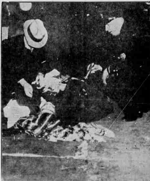
Police investigating the slaying of Walter W. Liggett, political newspaper publisher in Minneapolis, were without definite clues to the identity of his slayers although one man, believed to have established an alibi, was being held. The scene of the crime with its victim is shown.