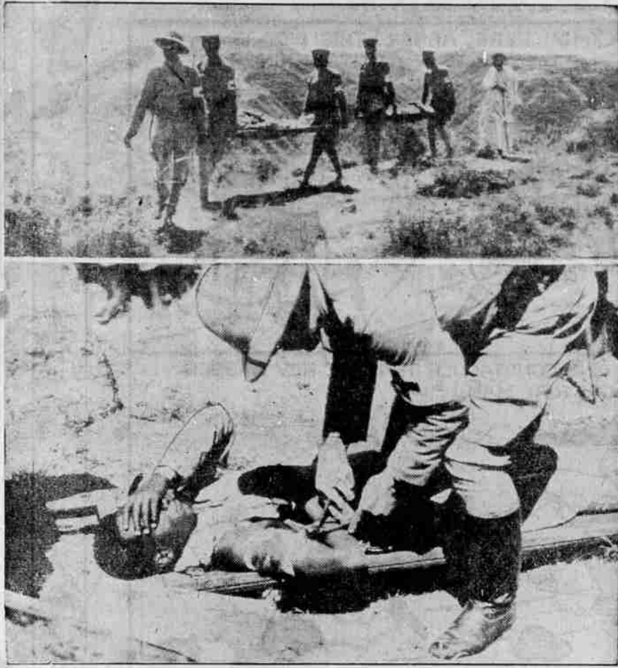
As the Italians and Ethiopians continue fierce skirmishes on the northern frontier, the wounded trickle over the mountains to Ethiopian headquarters at Dessye. Top, stretcher bearers in service of an Austrian Red Cross doctor, carry in casualties. Lower: a soldier shot in the arm is treated.