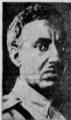
Gen. Ras Nassibu (above) commands Ethiopian forces in the south. He was reported to have virtually completed mobilization for an expected Italian attack along the Ogaden front.