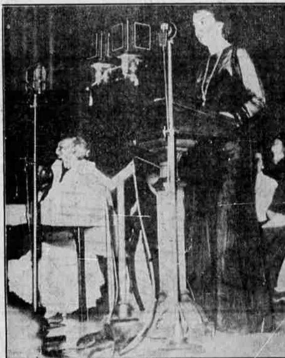
In a message read before the forum on current problems in New York by Mrs. Franklin D. Roosevelt, the President renewed his pledge to keep the United States free from entanglements that might lead to war. Mrs. Roosevelt is shown reading the speech.