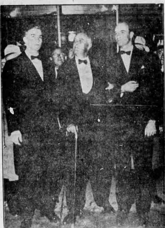
President Roosevelt leaving for his train for Washington from New York after assisting his sons, Franklin, Jr. (left) and James (right), in their third degree of Masonry. Three hundred fifty policemen guarded the President while he was in New York.