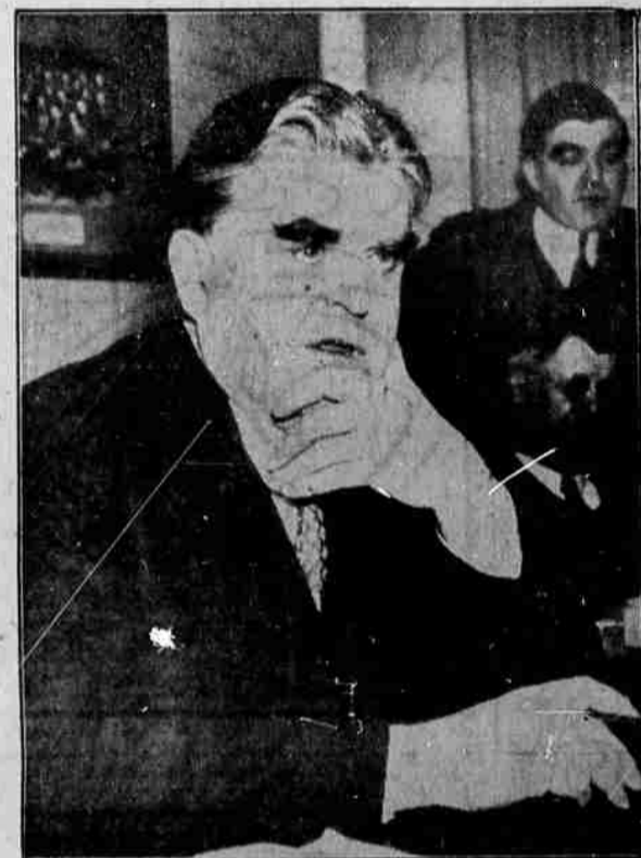
John L. Lewis, president of the United Mine Workers, in a grim mood as he declared that he resigned as vice-president of the American Federation of Labor because of "irreconcilable differences" with the majority of the council as to organization.