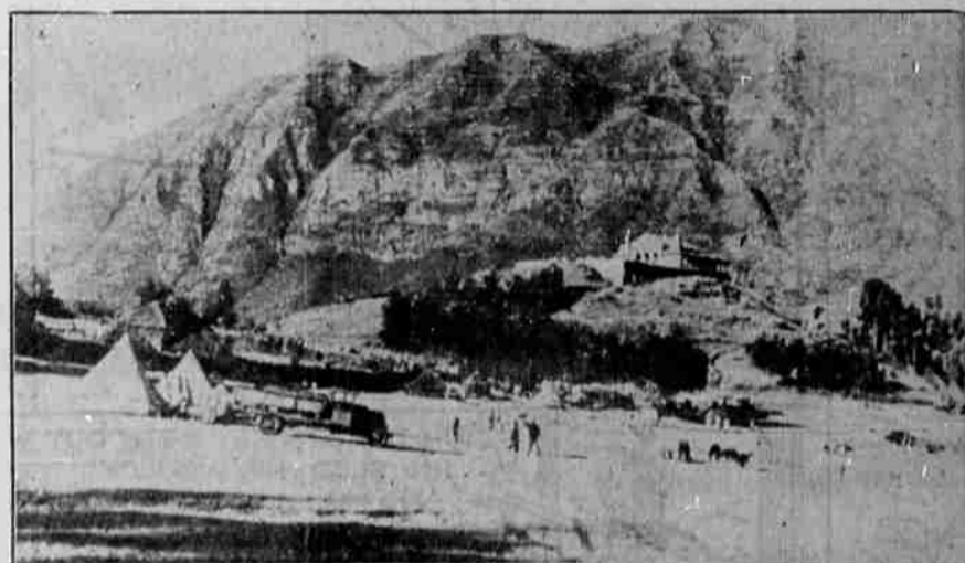
Nine Italian war planes bombed the town of Dessay, Ethiopia, wrecking the palace of Emperor Haile Selassie and partially destroying the American Seventh Day Adventist hospital. Casualties were reported heavy among the civilian population. The emperor took part in the fight against the attack, manning a machine gun. His palace, shown at the right, was a perfect target for Il Duce's fliers.