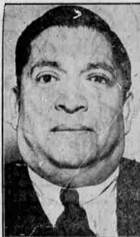
Gen. Saturnino Cedillo, Mexican secretary of agriculture, visited Los Angeles gathering information for formulating plans for a rural colonization and irrigation project to be established in Lower California.