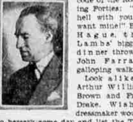
Portrait of a man, likely O. O. McIntyre.

THE hodge-podge block on West 67th street, between Central Park West and Columbus avenue probably houses more writers and artists than any similar stretch in even the Paris Latin quarter.