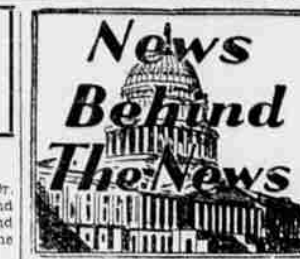
(Continued From Page One.)