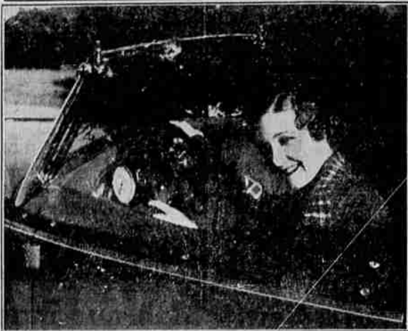
"Won't you come along with me?" says the smile in the picture, "and we'll tour the town properly in Ford's swank roadster for 1936." Youthful, fast, sturdy, easy to handle—the Ford roadster is just what the college boy or girl has in mind for dashing about the campus.