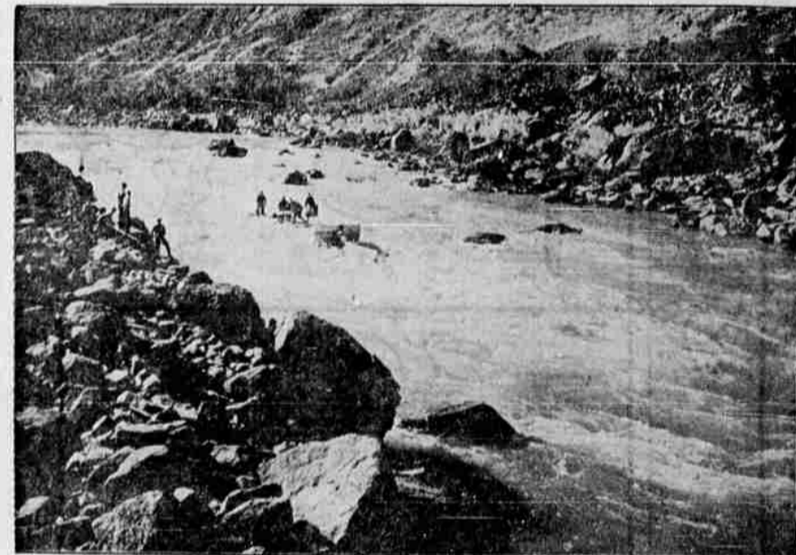
The National Geographic Society's expedition down the Salmon river is nearing an end and the party expects to reach Lewiston, Idaho, about Oct. 28. The trip was made down the "River of No Return" to obtain geological data. The expedition's barge is shown shooting over Bailey's rapids on the Little Salmon, 200 miles above Lewiston.