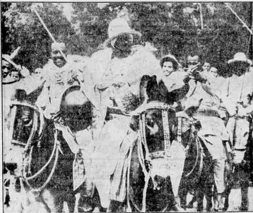
From out of the mountains came these Ethiopian tribesmen, answering their emperor's drum call to arms. See the spectacle on the warrior in the foreground, and the fellow aiming his rifle on the right. They all seem to be happy at the prospect of engaging the Italians in battle.