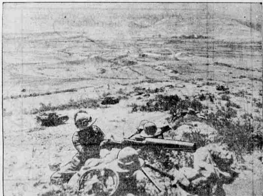
A machine gun crew in action behind a pile of rocks, as tanks covered the rough ground, bristling with guns, in the background. This action picture by Joseph Caneva, Associated Press staff photographer, was taken on the Adigrat-Makale frontier. The Italians took Makale in their latest drive. (Associated Press Photo)