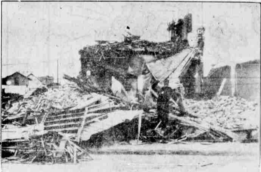
This was what remained of the Capital Hotel in Helena, Mont., after the latest series of earthquakes there. The hotel was badly damaged by the severe shocks of Oct. 18 and was flattened out when another heavy temblor struck 13 days later.