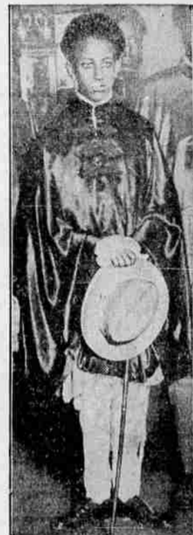
Recent arrival of Crown Prince Asfa Wosan, son of Emperor Haile Selassie, in Adis Ababa, gave rise to rumors that he would be crowned king, so Ethiopia would have a ruler in case anything happened to the emperor. The title would not infringe on that of the father, which is "King of Kings."