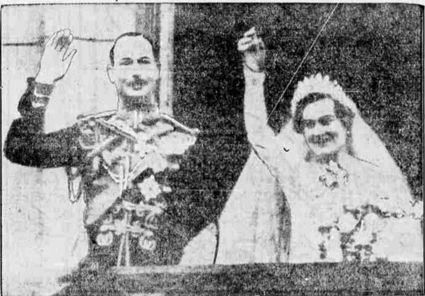
The Duke of Gloucester and his bride, the former Lady Montagu-Douglas-Scott, waving to throngs from Buckingham palace balcony after their wedding ceremony. This Associated Press Photo was taken a few minutes after the services, radioed to New York and then rushed to this newspaper.