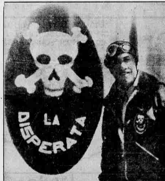
Count Galeazzo Ciano, Mussolini's flying son-in-law, is shown beside his airship of the squadron, "The Desperates," shortly after a bombing expedition over Ethiopia. The skull and crossbones are the squadron's sinister symbol.