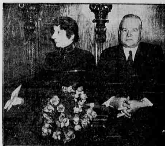
Gen. Evangeline Booth, head of the Salvation Army, and Herbert Hoover, former President, at a reception given in her honor in Los Angeles. Hoover introduced General Booth at the reception, which was held in the First Methodist church.