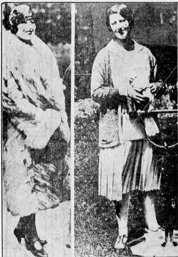
Mme. Majda Lupescu, in two poses, intimate friend of King Carol of Rumania, and the object of an "Anti-Lupescu" drive by the National Peasant party, surprised her opponents by returning from France to Rumania for the King's 42nd birthday.