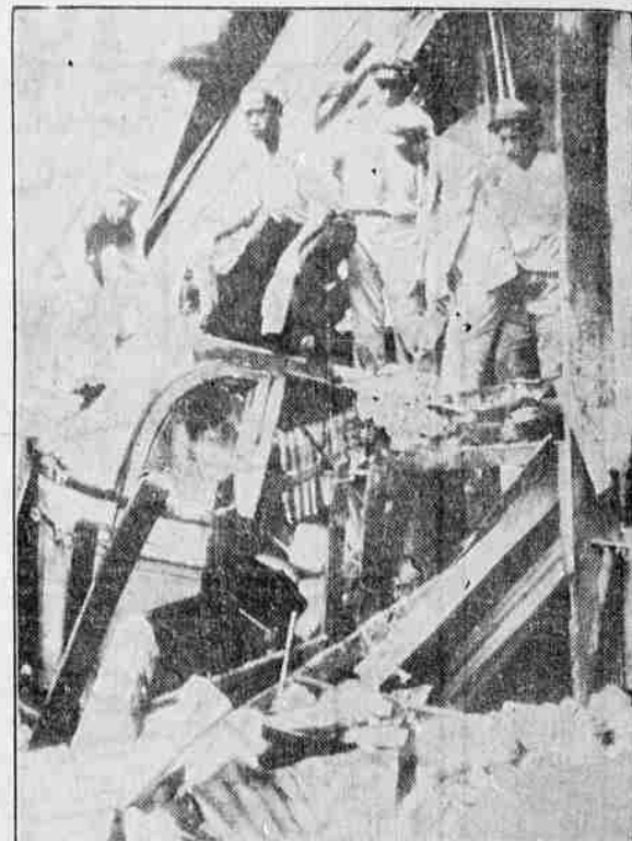
Here is wreckage left by the latest tropical hurricane to hit Cuba, the storm was the second of the season for the island. Roaring over the Santiago area, it did great property damage and left four persons dead.