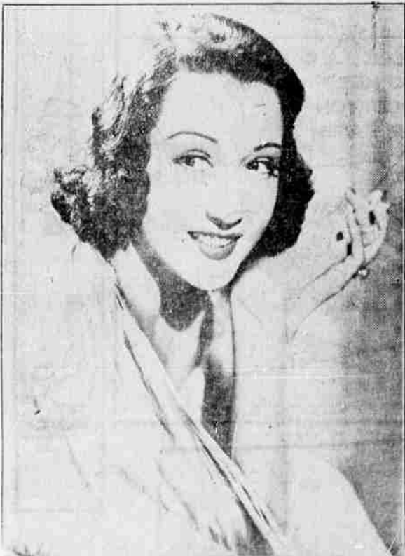
Ethel Merman, musical comedy queen, finished a movie in Hollywood and, after listing the faults she found with Hollywood, started packing for a quick get-away. She said the trouble with Hollywood is that it lacks night life, restaurants, theater audiences and well dressed women.