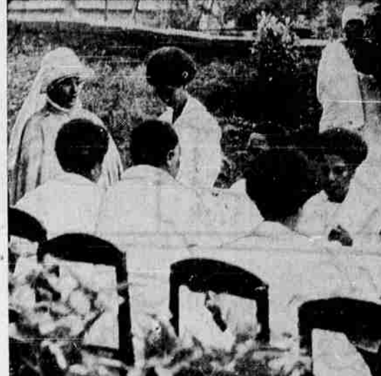
Empress Menen of Ethiopia (standing, left) and women of her royal court are shown making bandages for wounded troops as their contribution to the war against Italy. The bandages are turned over to the newly created Ethiopian Red Cross.