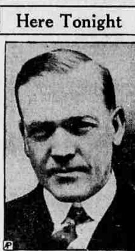
Senator Charles L. McNary who will be a guest of the Jackson County Chamber of Commerce at a dinner this evening at the Hotel Medford.