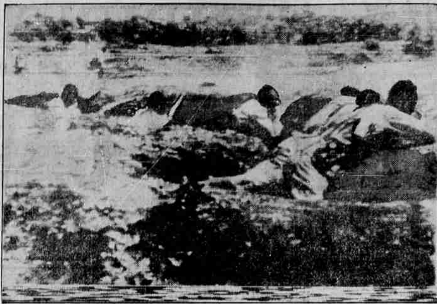
Guns at their shoulders and lying in shallow trenches, Ethiopian soldiers are shown near Harrar ready to repulse an attempted invasion by Italy.