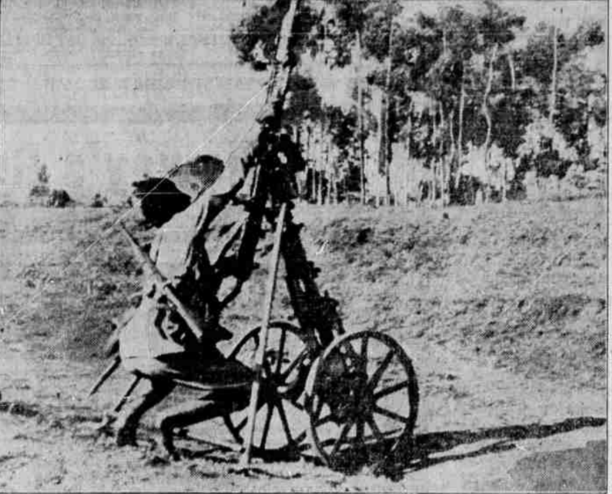
An Ethiopian soldier is shown setting up an anti-aircraft gun "somewhere in the war zone" to fight off Italian bombing planes in the Italo-Ethiopian war.