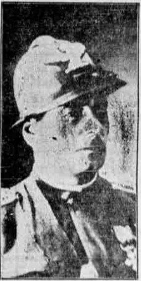
Premier Benito Mussolini selected General Allessandro Pirzio-Biroli (above), a crafty 68-year-old desert and mountain fighter, to act as one of the "Big Six" in East Africa. He commands native troops of Eritrea, prominent in early fighting.