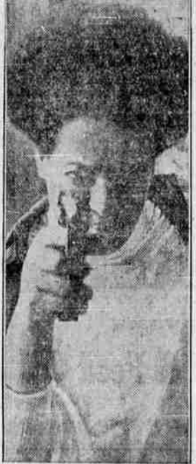
The women of Ethiopia have taken the field with their men. This woman, shown taking deadly aim with a pistol, has founded an army of 3,000 female soldiers to engage in active fighting. Her name, in English, is "one who became a flower."