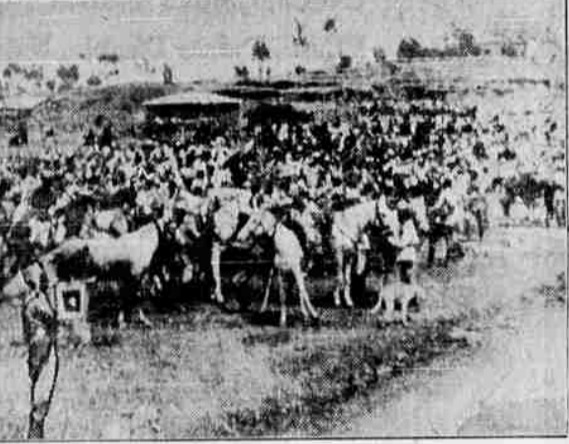
These two pictures show the departure for the Ethiopian front of Italian colonial troops, Askaris, commanded by white Italian officers. They were believed to have participated in the capture of Adduwa and other key cities north of Addis Ababa.