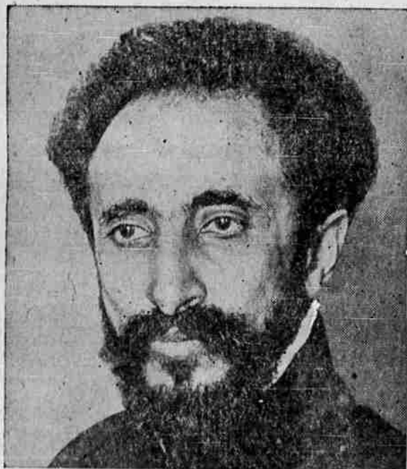
HE LEADS THE ETHIOPIANS —Emperor Haile Selassie of Ethiopia, the King of Kings, who roused the war call to his people to defend their free country.