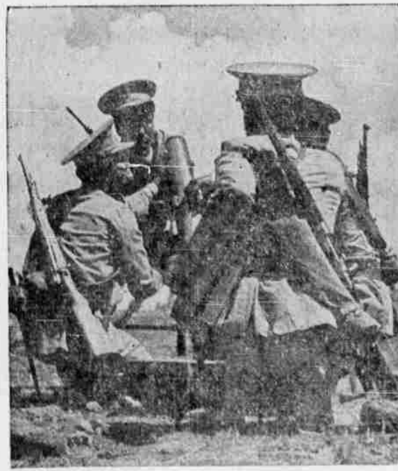
READY —Ready for the invader are these Ethiopian soldiers as they prepare to fire a round from their small field gun.