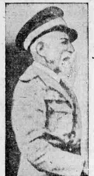
DIRECTS CAMPAIGN —General Emilio De Bono was caught in this military pose as he reviewed Italian troops in Eritrea, near the Ethiopian border. He commands the Italian expeditionary forces.