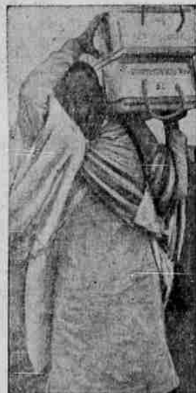
AMMUNITION —For Ethiopia ammunition may be a deciding factor in the war as the supply has been reported small. Native runners carry it on their shoulders and heads.