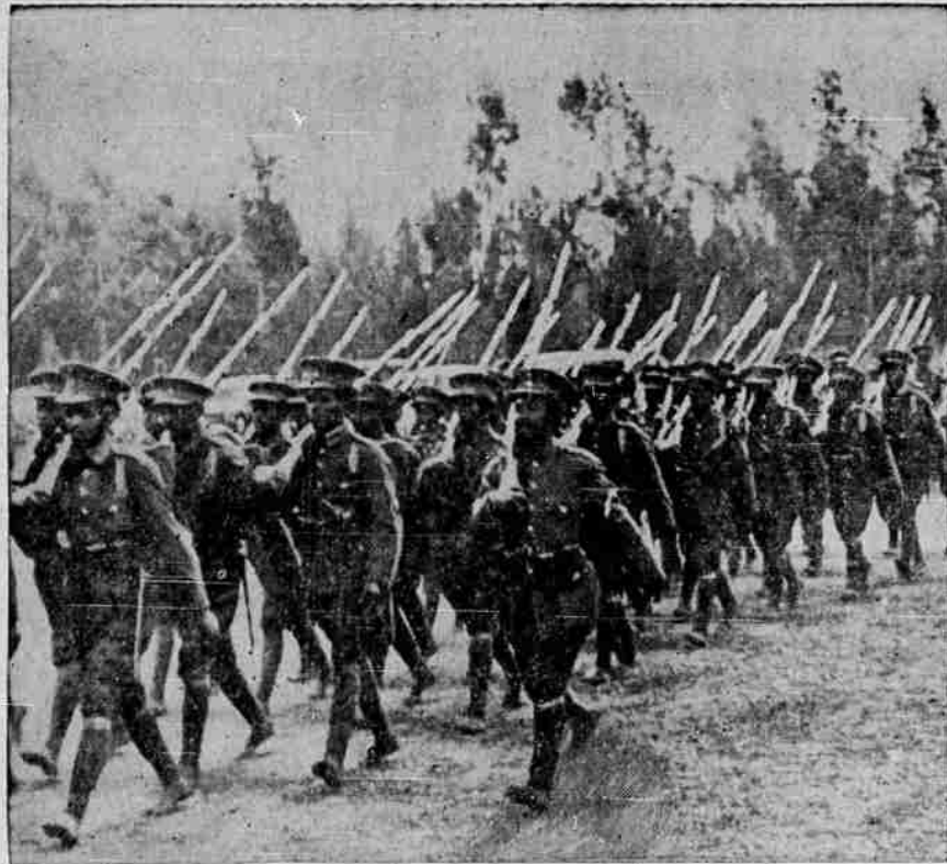
MARCHING TO THE FRONT —These Ethiopian regular soldiers were caught by the photographer as they were ordered from Addis Ababa to strengthen frontier sectors where the first Italian attack came.