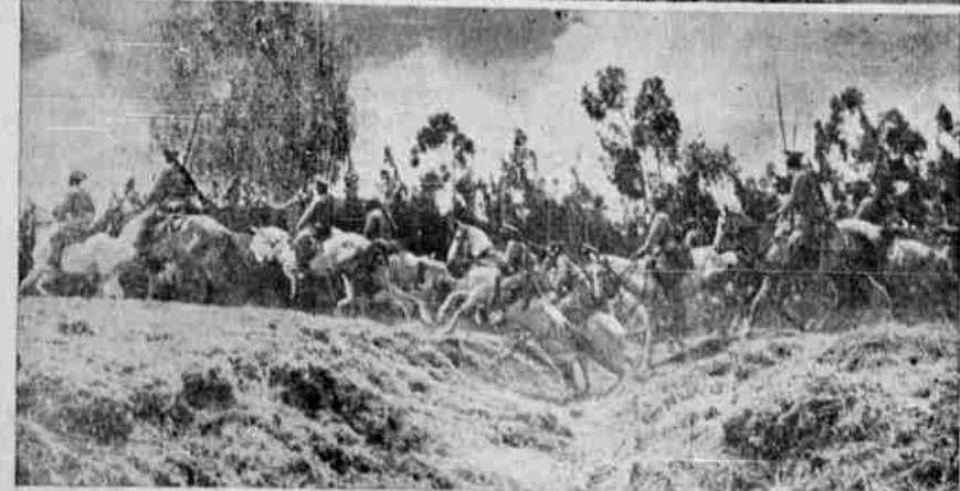
CABINET AND CAVALRYMEN —Above is the Ethiopian cabinet, dressed in braided uniform and cockade hats, while below, is a detachment of fierce Ethiopian cavalrymen as they dashed at full gallop across a ditch.