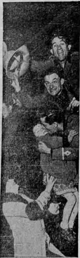
FAREWELL —Italian troops continue to be rushed to the battlefield. Here a fond father bids his small daughter goodbye as he and his fellow soldiers entrain.