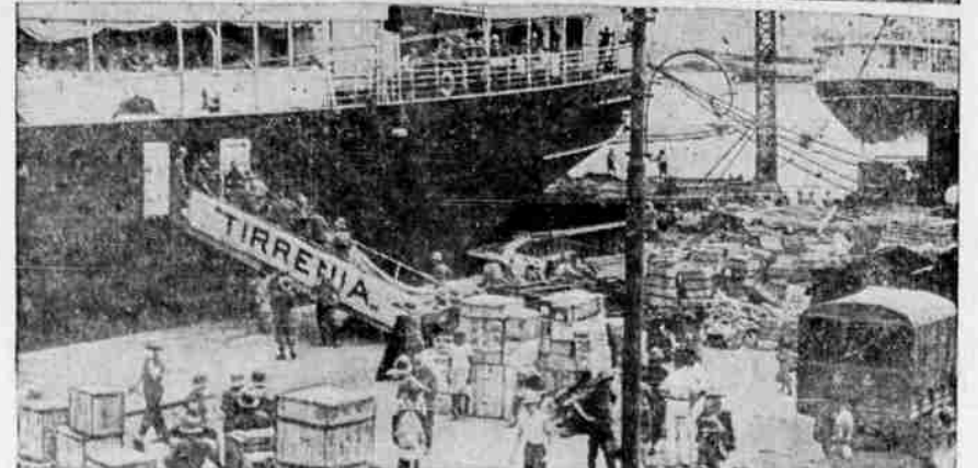
MEN AND SUPPLIES —Italy has sent nearly a quarter of a million men to the Ethiopian battle scene, along with countless millions of dollars worth of supplies. At top is a group of infantrymen in Eritrea and below, supplies being unloaded at Massawa, Eritrea.