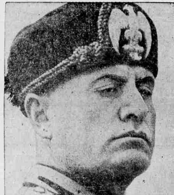
HE LEADS THE ITALIANS —Dictator Mussolini, ruler of all he surveys in Italy, who set as his goal the conquest and colonization of African Ethiopia.