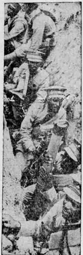
WATCHFUL WAITING —Ethiopian "regulars" entrenched in a frontier sector awaiting the Italian enemy.