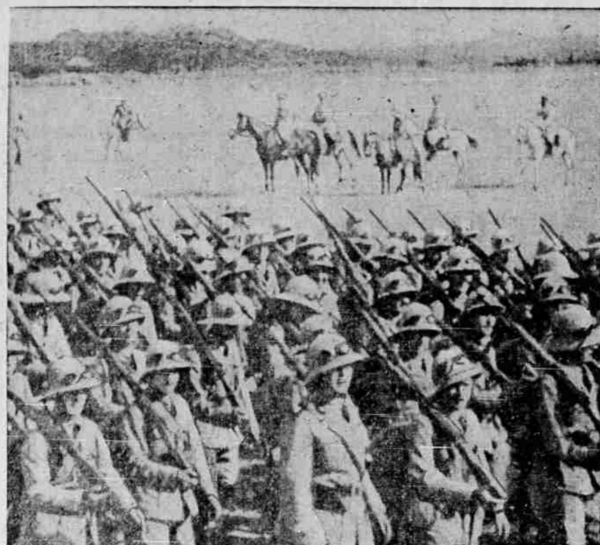
REVIEW BEFORE THE BATTLE —Bayonets fixed, Italian soldiers march in review before their leaders a few days before hostilities began. They are pictured in Eritrea.