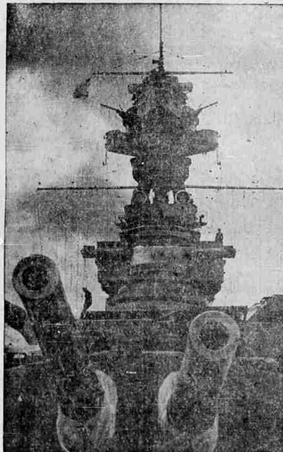
BRITISH WATCH DOGS —As Italy and Ethiopia clashed, a mighty British fleet was poised in the Mediterranean awaiting developments. Here is an example of the huge guns the British are prepared to man if trouble arises involving any British rights or possessions.