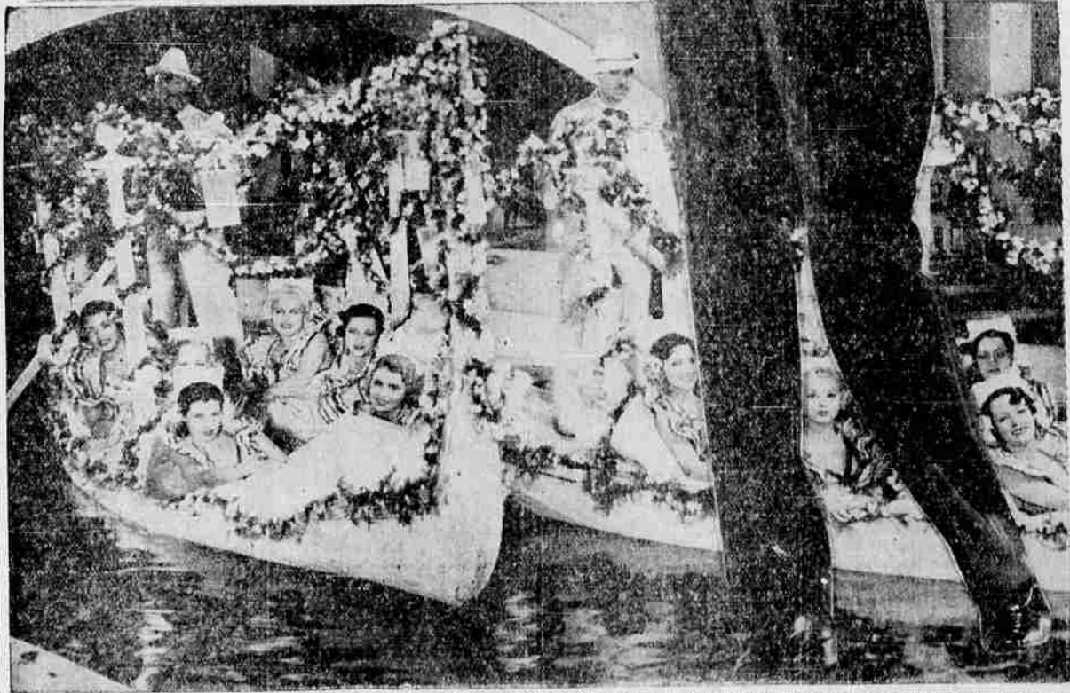
The incomparable dance team, Fred Astaire and Ginger Rogers, are featured in the musical show "Top Hat" which opens Sunday at Hunt's Craterian. Irving Berlin, dean of melody, composed the music and lyrics in this outstanding production.