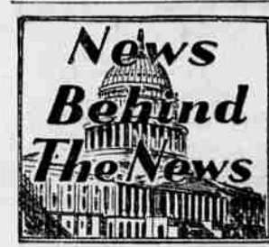
News Behind The News