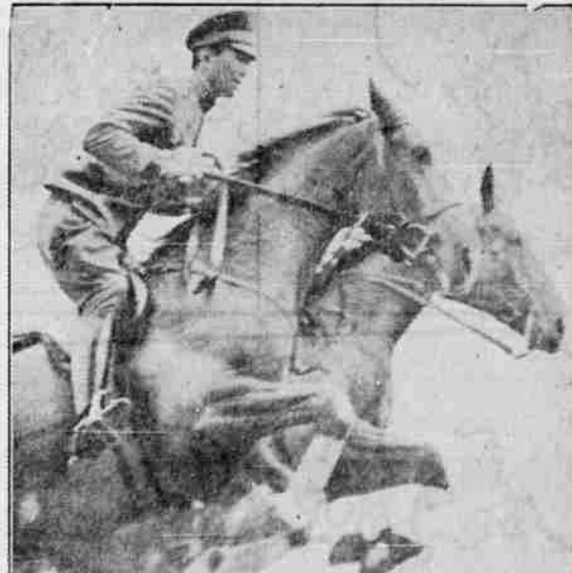
Capt. Baron Takechi Nishi, one of the few who guided their mounts over the difficult steeplechase course at the 1932 Olympiade in Los Angeles, is shown training in Japan to defend his Prix des Nations championship at Berlin next year.