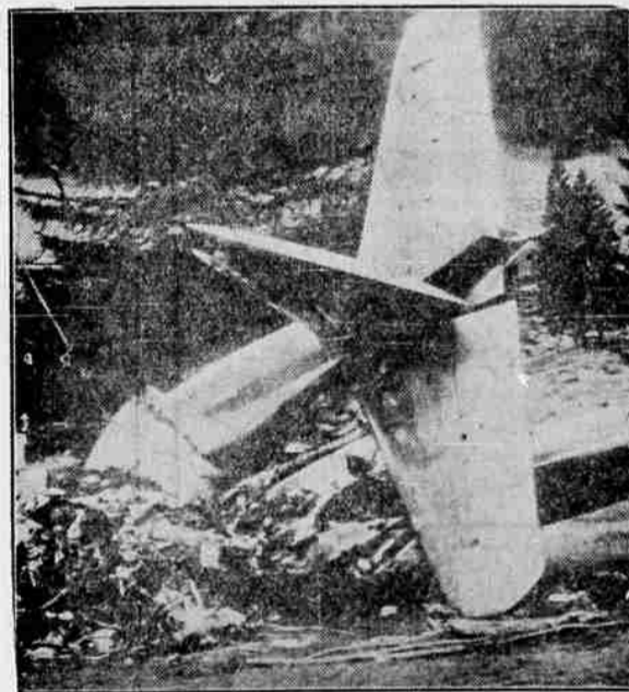
This first picture of the wreckage scene at San Bernardino, Switzerland, shows all that was left of the palatial Royal Dutch "flying hotel" which crashed July 21 while flying "blind" in a storm over the Alps. All 13 occupants were killed.