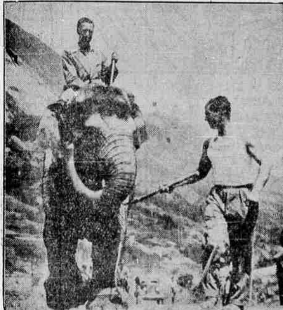
This is one way to cross the Alps, but not a new one, for Hannibal used it way back yonder to invade Italy. Richard Halliburton, American writer atop the elephant at St. Bernard Hospice, Switzerland, was merely to see what kind of a ride it was. He called his steed "Miss Dolly."