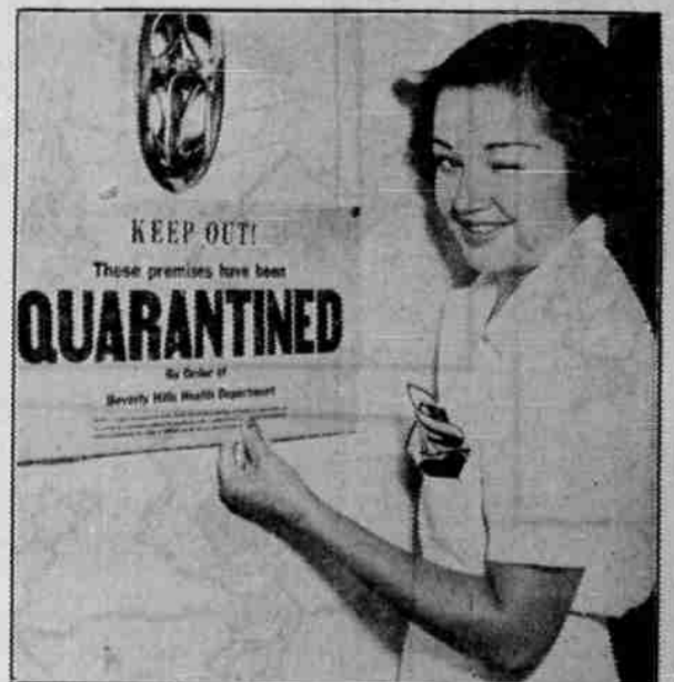
After being quarantined three weeks with scarlet fever, Arline Judge (above), film actress, winked happily as she removed the health officer's sign from her Beverly Hills, Calif., home.