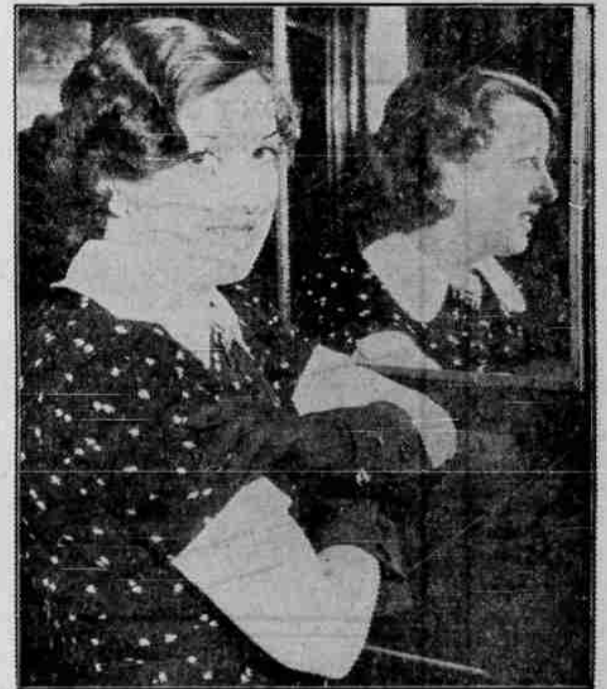
Estelle Taylor, film actress and former wife of Jack Dempsey, went to court in Los Angeles and obtained the legal right to change her name from Estelle Taylor Dempsey to Estelle Taylor.