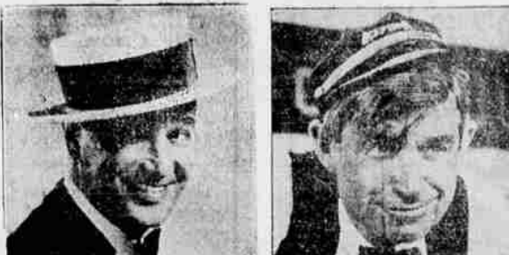
This week promises to be an outstanding one in film entertainment. With the opening today of the Crawford-Montgomery picture, "No More Ladies," the Craterian will have Maurice Chevalier in "Folies Bergere" for the Wednesday show and, starting Thursday, Will Rogers, America's beloved humorist and screen favorite of millions, in "Steamboat Around the Bend."