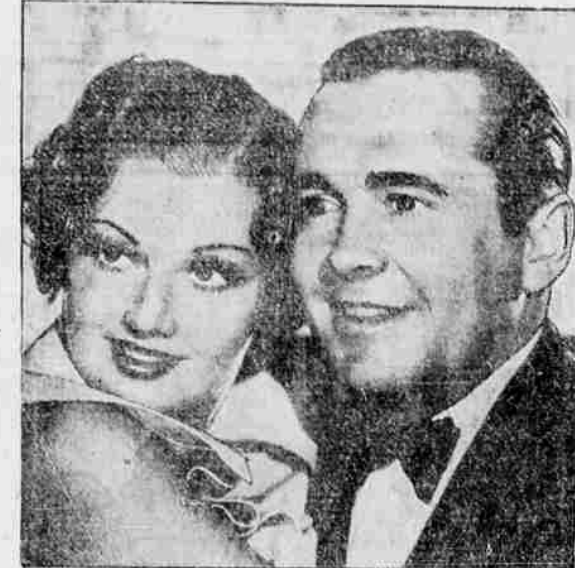
What mirthful situations can arise when a group of slick "con artists" swoop down on a small rural village with every intention of trimming the natives, only to find their schemes backfiring on them, are hilariously brought to the screen in "Welcome Home," playing today and Monday at the Rialto theatre. James Dunn, as "Dickie," Arline Judge as "Gorgeous," Raymond Walburn as "Giltedge," and William Frawley as "Painless" head the cast which also includes Rosina Lawrence, Charles Sellon, and the old-