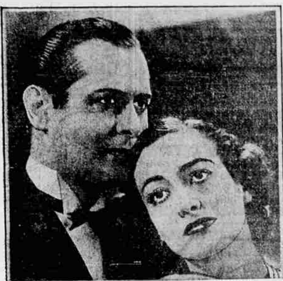
Joan Crawford and Robert Montgomery head a fine cast in "No More Ladies," starting a three-day run at the Craterian theatre today. Franchot Tone, Charlie Ruggles, Edna May Oliver, Gail Patrick, Reg-