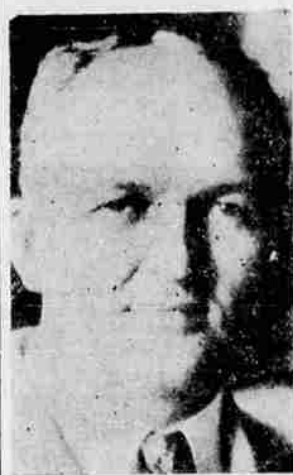
Justice John B. Fournet (above) of the Louisiana State Supreme Court grabbed the gun of Senator Long's assailant before the man could fire a second time, causing the shot to be deflected, but the one bullet proved fatal to Long.