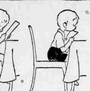
STOPS WITH PARENTS AT WAYSIDE RESTAURANT GRIDDLE CAKES AND FOR LUNCHEON, IS ENEN MENU AND TOLD TO PICK SYRUP ?