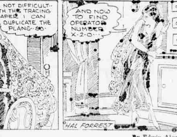
By Edwin Alger