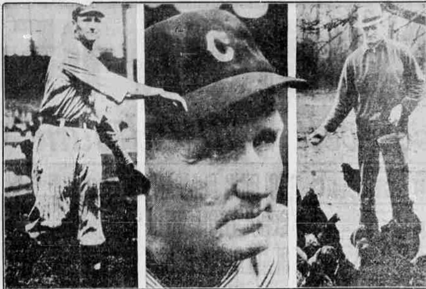
The resignation of Walter Johnson, one of baseball's immortals, from the management of the Cleveland Indians caused sports followers to wonder if the "Big Train" had completed his time as an active baseball man. Left: Johnson in pitching prime. Right: On his Maryland farm.