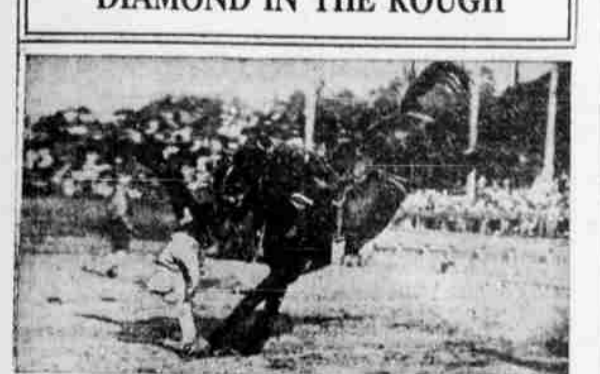
Jack Meyers leaving "Black Diamond," champion bucking horse that will appear at the Oregon state fair rodeo in Salem, August 31-September 7. The rodeo will open Labor Day night following the horse show.