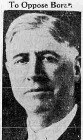
Postmaster General Farley has approved the Democratic party's approval on Gov. C. Ben Ross of Idaho (above) as an opponent to Sen William E. Borah.