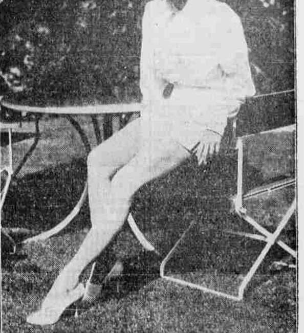
Marlene Dietrich, film actress, is shown in the garden of her home near Hollywood, Calif., where she rests and occasionally swims in her pool, while waiting for the start of her next picture. The play suit Miss Dietrich wears shows off her famous legs to advantage.