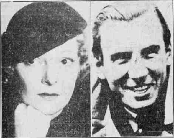
While both met questioners with silence, rumors were current in London that Fred Perry, world's amateur tennis champion, and Helen Vinson, screen actress (shown above) soon would announce their engagement.