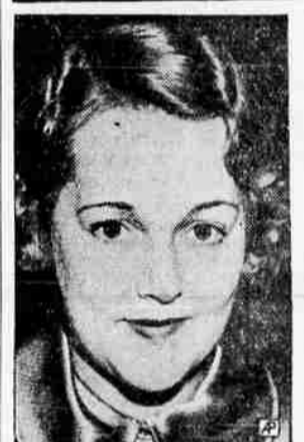
MRS. HAROLD LLOYD

Mildred Davis retired from films when she became Harold Lloyd's leading lady in real life. . . . She presides as chaperone of one of the colony's most elaborate setates. . . . and keeps life there as simple and homelike as though it were a cottage by the wayside. . . . Blonde and blue-eyed, Mrs. Lloyd shares with the comedians a love of play, likes being with people and loves a joke. . . . even a practical joke. She has a robust sense of humor, a hearty manner, and is a gracious hostess, entirely unaffected and attractive. Like Harold, she is a devoted parent to their three children. . . . She dislikes sham and pretense, has friends in and out of pictures, people of no "importance" and people of wealth and social position. . . . She is one-half of Hollywood's Number One Happy Marriage.