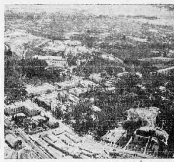
Aerial view of San Diego's California Pacific International Exposition, where color, romance and amusement have been woven into a labyrinth of interesting exhibits. Balboa Park, 1400 wooded acres shaded by palm, acacia, cypress and other beautiful trees, houses the many buildings of early Spanish architectural design.