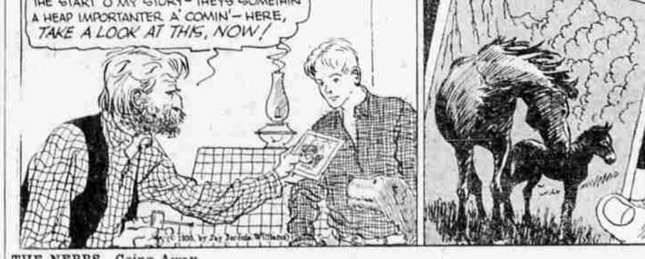
By Edwin Alger