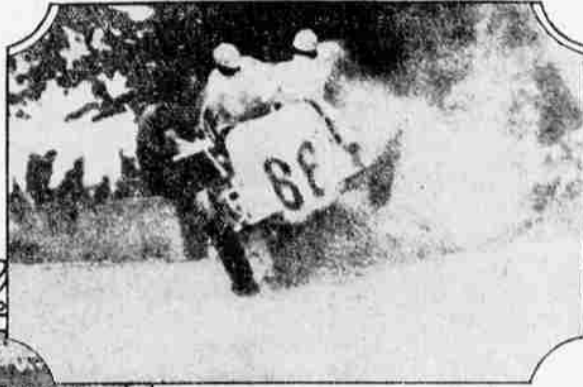
This car hit the speedway retaining wall at terrific speed, and bounced many yards off the track. The chassis was completely wrecked, yet tires suffered no injury.

performance of the tires. Though the chassis were wrecked, the tires were found fully inflated and undamaged.