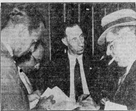
Harry Bridges (center) in a group of reporters in New York as the International Longshoremen's Association began its convention. Bridges, Pacific coast leader of the "left wing" of the I. L. A., is looked upon as a certain candidate for the presidency, held by Joseph P. Ryan for eight years.