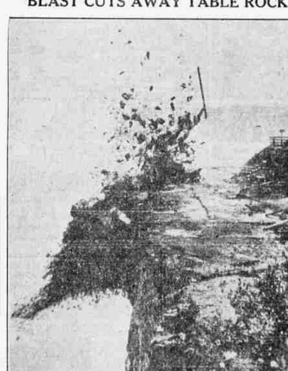
A big charge of explosives ripped a 5,000-ton chunk out of Table Rock, famed observation point for newlyweds at Niagara Falls. Weakened by rock slides, the ledge point from which a closeup of the Horseshoe falls is obtained, is being cut back to make it safe.