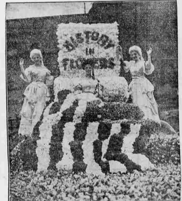
These floral and feminine beauties of Pasadena, Calif., won the out of town parade sweepstakes at the Portland, Ore., rose festival.