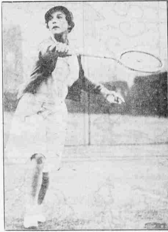
Helen Wills Moody didn't lose any time in settling down to practice upon her arrival in England in hopes of doing a comeback at Wimbledon this season. The former tennis champion flashed some of her old form in the first tournament she entered in Old Albion. She is shown practicing at the All-England club.