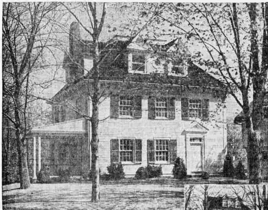
The two photographs show how an outmoded Montclair (N. J.) house was transformed into an up-to-date residence. The property was placed on exhibition immediately following completion of the repair work and was sold within five days. While the work was not financed under the modernization credit plan, it is a graphic example of the "sales appeal" produced by intelligent modernization. New paint, removal of the outmoded porch, landscaping, the inclusion of a side porch, and general repairs to the interior transformed a "dead" property into a much-desired structure. Several persons attempted to purchase the house soon after it was placed on exhibition.