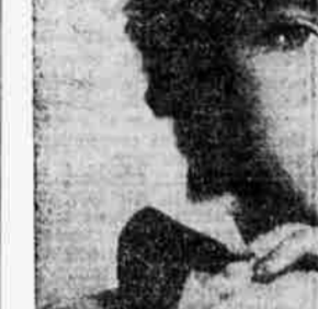
"The Girl from 10th Avenue," starring Bette Davis, will be the attraction at the Craterian theater for tomorrow night, with the same program also to be shown tomorrow night at the Holly theater.

Miss Davis' part is far more sympathetic than the one she played in "Of Human Bondage," but it is anything but a sweet girly-girl role. She portrays a 10th avenue shop girl who marries a drunken society man, following a champagne party. He had gone to the dogs when filled by a gold digger. Bette makes a man of him, and is smart enough to separate him from the woman he formerly loved, and who had married a rich relic for his money, thinking that she could continue to flirt with the man of her choice.