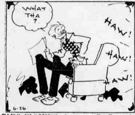
TAILSPIN TOMMY—A menace—For Tommy!