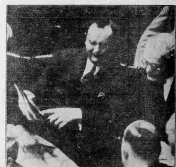
Representative Patman (left) Democrat from Texas, chatting with a colleague in the house just a few minutes before President Roosevelt appeared before a joint session of the congress to read his veto message of Patman's two billion dollar cash bonus bill.