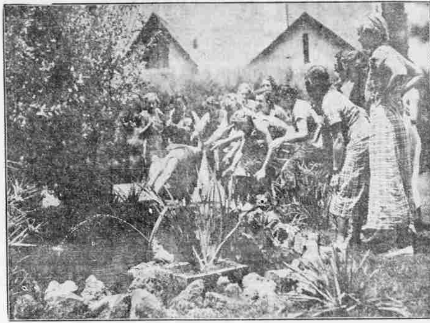
A traditional ceremony at the University of Arizona is the ducking of graduating coeds by the underclass women. Here's one of the girls going into the fish pond during the annual splash.