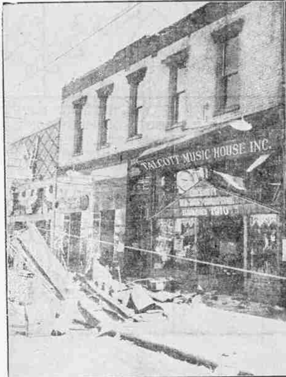
When a cornice of a two story building in Yakima, Wash., collapsed one person was killed and 32 injured. Several of the injured fell from the roof or top of others watching a parade. The wreckage which tumbled to the street is shown.