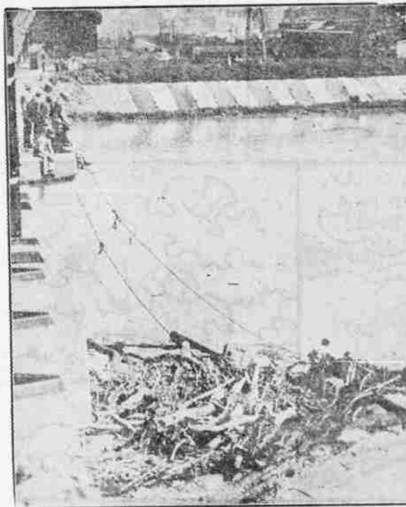
With the crest of the Kaw river flood sweeping toward Kansas City, workers strove to keep debris away from bridge supports. One of the workmen is shown at his task with ropes attached for rescuing if he should slip into the river.