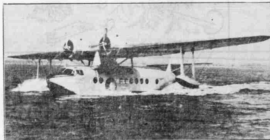
The S-43, new Sikorsky amphibian, speeding along the surface of the Housatonic river at Stratford Point, Conn., during her first test flight. The ship, with a speed of 200 miles an hour, is said to be the fastest amphibian and is destined for service in Hawaii.