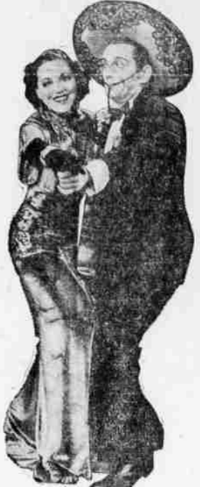
Winifred Shaw gives Edward Everett Horton a little lesson in Hispanic rhythm in the new musical production, "In Caliente," at the Craterian theater starting Sunday.

The picture, which stars Dolores Del Rio and Pat O'Brien, has O'Brien as a magazine editor whose long stay is staying inebriated as much as possible and gets mixed up with a child-like blonde, Glenda Farrell. His boss kidnaps him and takes him to Mexico to sober up, where he meets Miss Del Rio in the role of a famous dancer. The resulting action films laugh sequences piling pell-mell over one another as blonde and brunette flare into an intense rivalry for O'Brien's attentions.