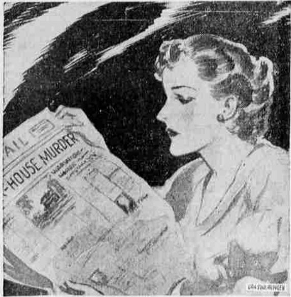
"EMPTY HOUSE MURDER," the heading ran.

DAPHNE dived on her plans for the honeymoon, "I know the man who runs the place and he told me that there are wonderful climbs, and I thought we'd picnic and Alison and I could explore them while you played with your plants, Bob." "I'm not sure that I'll come," Robert winked at his daughter. "You haven't said 'thank you' yet!" "I've done something much better," retorted Daphne. "I've made you four wotty chocolates you love!" "Ah!" Robert was rather overacting his part, rubbing his hands together, smiling at Alison. "I tell you, Daphne's home-made chocolates are something to write home about!" "You're not going to get one yet!" Daphne was arch now. "Wait!" She turned to Alison. "One can't get